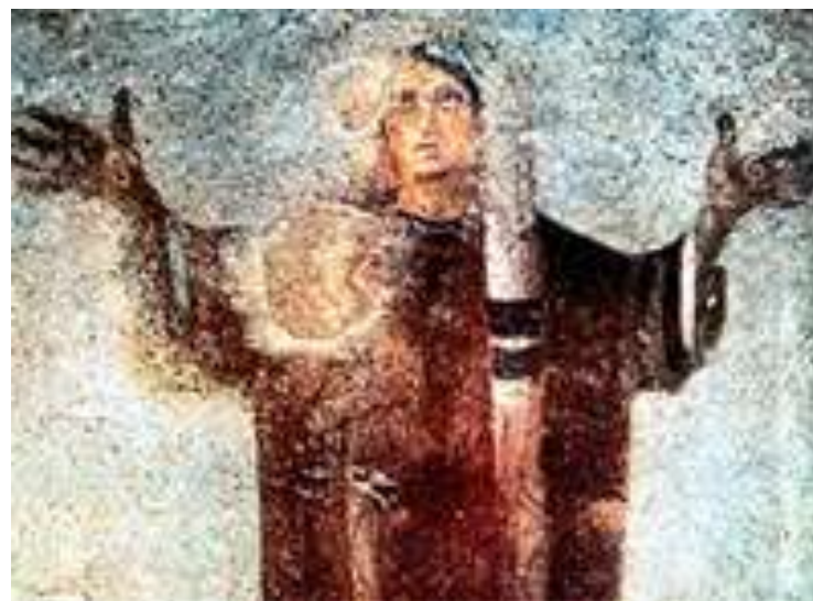
Ancient gesture of Christian Prayer from the catacombs of Priscilla